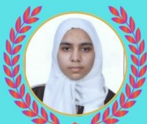
MISS. MANTASA FINE ARTS - 100