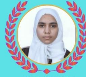
MISS. MANTASA FINE ARTS - 100